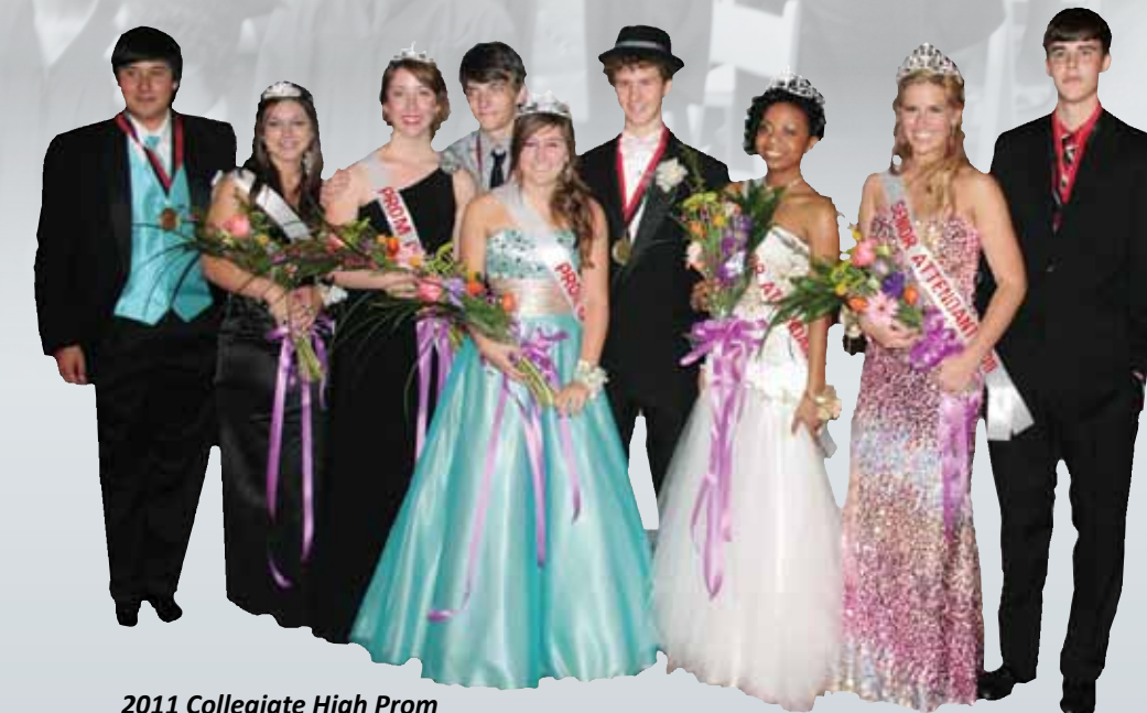
2011 Collegiate High Prom